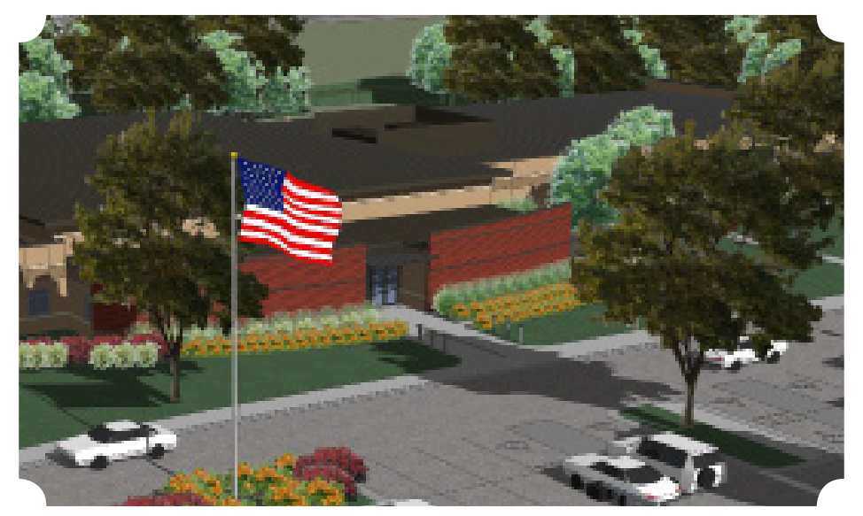
The new campus will be almost three times as large as the current campus at approximately 52,000 square feet. The current campus is 18,000 square feet, which includes general classrooms, nursing laboratories, and computer laboratories.