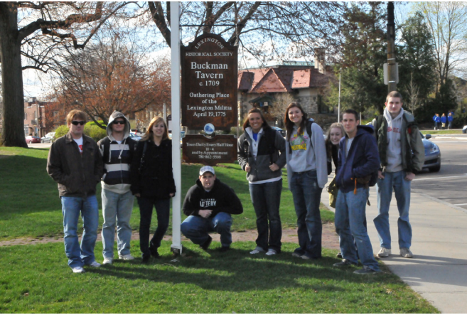
The NCCC History Club provides all students with the opportunity to broaden their knowledge of different aspects of History. The club travels every spring to get an indepth knowledge of American History. This year we traveled to Boston, Lexington, Concord, and Salem, MA studying Colonial and Revolutionary Historical sites.